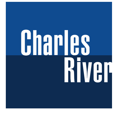
A State Street Company